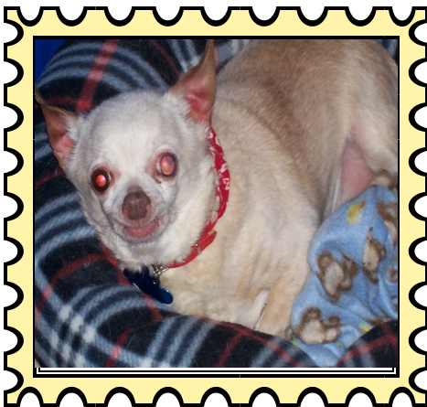
Max- My first foster