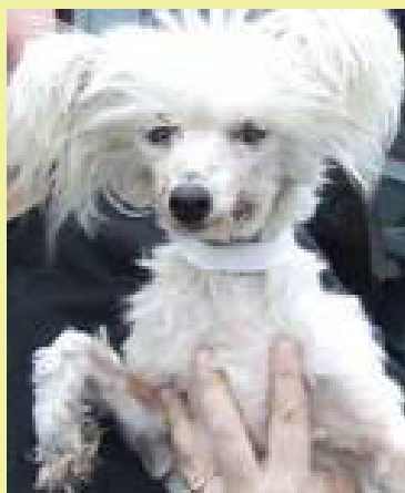
Pearl a beautiful girl